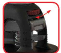
Professional model St/steel mechanism

Safe, user-friendly "1/4-turn" closure system with indicators. Easy to assemble and dismantle